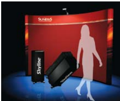
Backlight end panels to bring attention to fabric panels and detachable graphics.

Protects backlighting components and simply attaches to Mirage cases for easy transport.